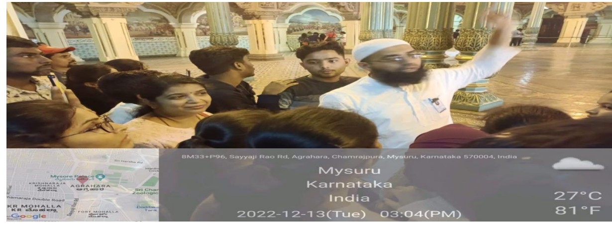
Guide is explaining the history of Mysore Palace.