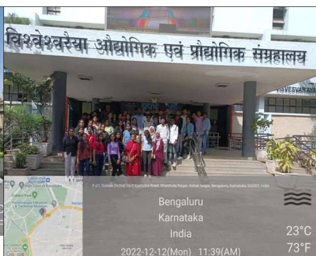
Visvesvaraya Industrial & Technical Museum (VITM) Bangalore, Karnataka.